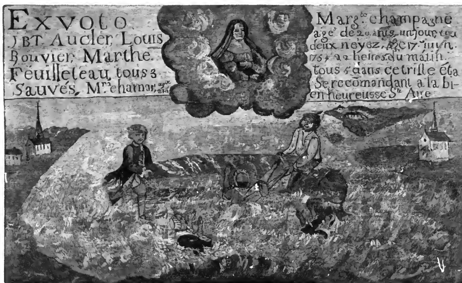
EX VOTO PAINTING, 1754.

which the pilgrims pin on their coats and dresses, like the shells worn by the pilgrims who have visited the shrine of Ste. Anne in Brittany. Heaps of little brass and plaster statues, photographs, beads, and other trinkets, attract the visitor. The air is full of babble from the crowds of tired yet talkative people sitting on the grass or the benches, eating their luncheon out of huge carpet-bags. Two girls, who had heard from me of the wonderful well in Brittany, were throwing pins into the fountain to find out their matrimonial prospects, and laughing heartily over their efforts. When the pins fell head foremost, hope grew sick; when the points first touched the water, the prospect of marriage within a year was certain. I noticed that, like the Chinese praying to his